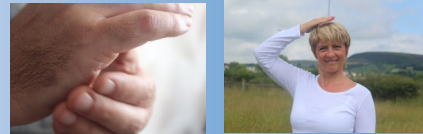
Karate Chop set up point Top of Head Governing Point

7-9 AM 5-7 AM TAP: Age 12+ FOR UPTO 30 SECONDS ON EACH POINT Child Age 0-12- 1-10 Seconds